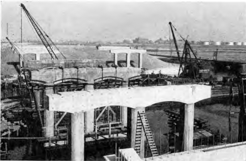
Figure 3. Construction of substructures for the Rahway River crossing. This dual crossing provides two separate parallel structures, one for northbound traffic and the other for southbound traffic. Both will be identical in size and design.

After it became evident the Turnpike could be financed and would be self liquidating, negotiations were started immediately for the selection of nationally recognized firms of consulting engineers to determine the final alignment, prepare contract plans and specifications, property maps and for supervision of construction. The Turnpike was divided into seven sections, and the eight firms selected on September 22, 1949, are, beginning with the southern section: J. E. Greiner & Company; Gannett, Fleming, Corrdry & Carpenter, Inc.; Parsons, Brinckerhoff, Hall & Macdonald; DeLeuw, Cather & Co.; Fay, Spofford & Thorndike; Amman & Whitney; Frederick R. Harris, Inc., Edwards and Kelcey, and O. J. Porter & Co., Associated; and Howard, Needles, Tammen & Bergendoff who, also, are general consultants for the Authority.