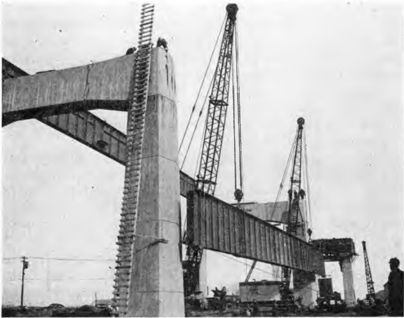
Figure 1. Steel girders being placed on concrete piers at the Passaic River Crossing.

Confronted with this steadily rising and record traffic, the State Highway Department in 1946 made a study to determine the minimum construction that would be required to provide for the then existing volume and found urgent need for a $600 million highway construction program. At the same time several plans were developed for financing this construction involving an increase in gasoline taxes and a bond issue or a combination of both. None