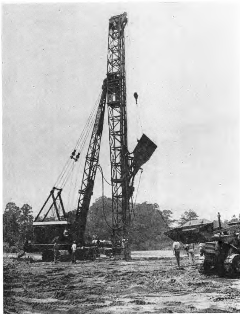
Figure 4. Placing "sand drains" up to 100 feet in depth through swampy areas has speeded up the consolidation of road embankments. This figure illustrates one type of rig used to install sand drains.

In addition, there will be stabilized shoulders on either side of the travel lanes; 16 feet on the right, or outside, 10 feet of