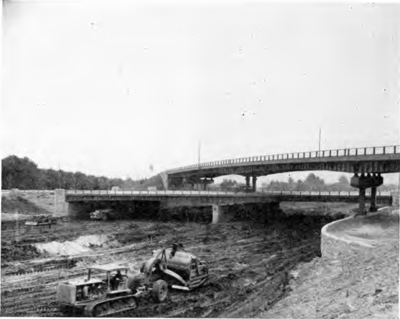
Figure 5. At a point in Woodbridge Township, the Turnpike passes under two existing highways. The upper route is Woodbridge Avenue, the middle level is Route 4 Parkway. Equipment is shown completing excavation for the lower Turnpike level.

Horizontal curves of 10,000-foot radius and sharper will be super-elevated and curves with 3,500-foot radius and less will be spiraled.