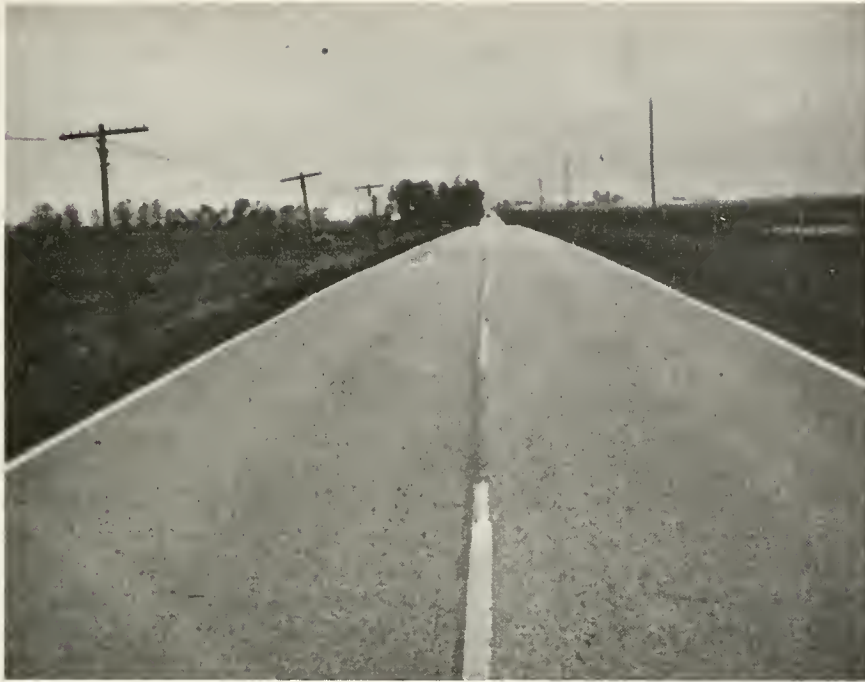
Figure 5. Portion of U.S. 421 north of Lafayette, Indiana, in White County. The right side of the road received a single fall application of an experimental formulation (M-3766) containing 3 parts picloram and 1 part 2,4-D at a rate of 2 lbs active ingredient per acre. The left side of the road was unsprayed. Photographed in the spring following application.