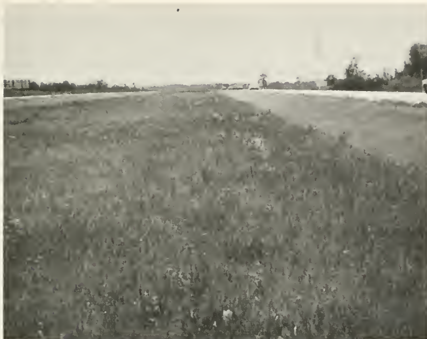
Figure 3. Unsprayed median of I-69 near the Indiana-Michigan border. Numerous weeds are seen in the foreground. Photographed June 2, 1973.