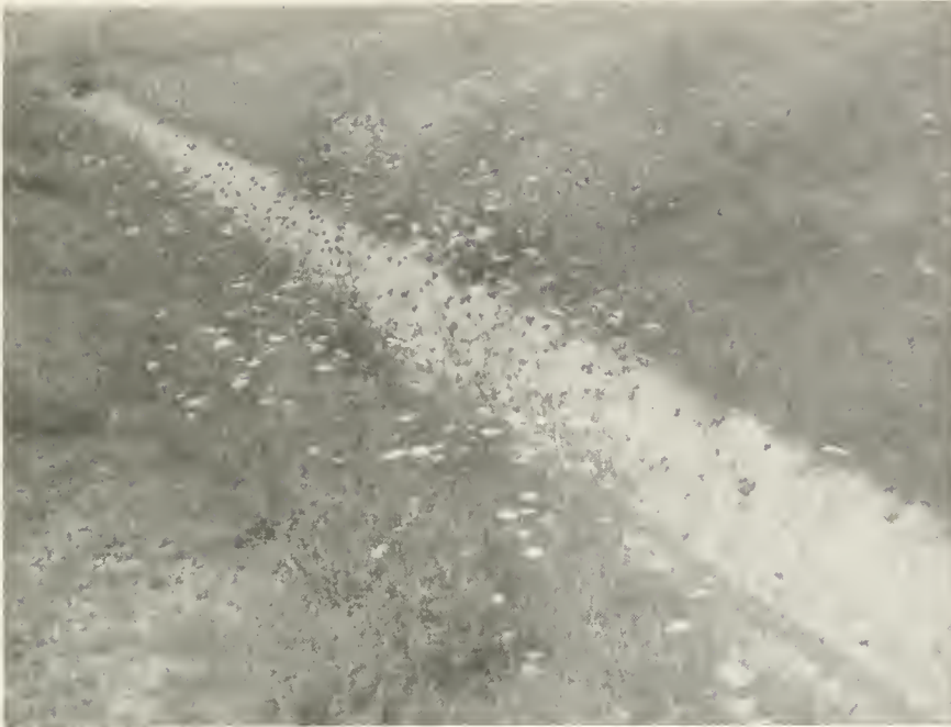
Figure 8. Appearance of test plots in a 3-year evaluation prior to spraying in early August 1970. Wild carrot was especially abundant and unsightly.