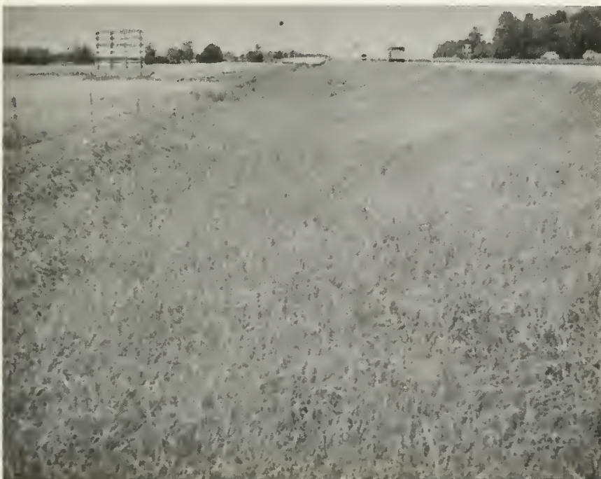
Figure 2. Sprayed section of I-69 near the Indiana-Michigan border. This portion received the fall-spring 2,4-D application cycle in the 1972-73 season in the Spraying Program by Contract (Table I). The roadside is essentially weed-free. Photographed June 2, 1973.