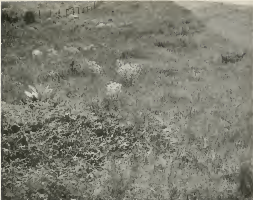
Figure 1. Unsprayed section of I-69 near the Indiana-Michigan border. Tall weeds and grass have smothered out the turf leaving patches of bare soil subject to erosion. Photographed June 2, 1973.