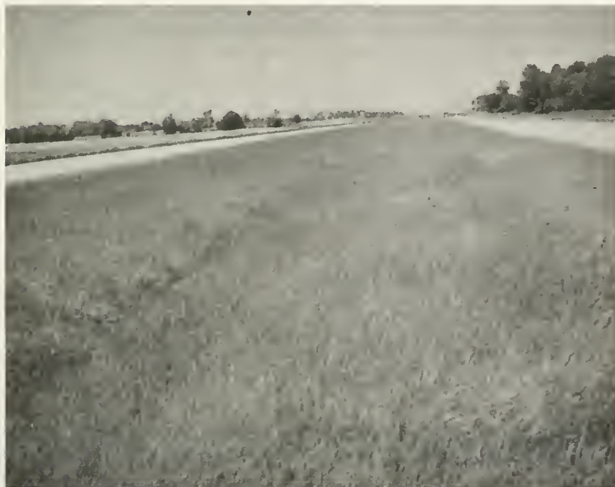
Figure 4. Sprayed median of I-69 near the Indiana-Michigan border. This portion received the fall-spring 2,4-D application cycle in the 1972-73 season in the Spraying Program by Contract (Table I). The area is essentially weed-free. Photographed June 2, 1973.