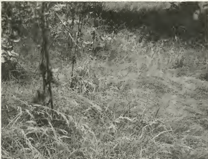
Figure 6. Wild parsnip plots on July 25, 1972 approximately 2 years after treatment with a mixture of 3/4 lb per acre of picloram plus 1/4 lb per acre of 2,4-D. The unsprayed area is on the left and shows numerous plants of wild parsnip 4 to 5 feet high which have matured and produced seed. The treated area is on the right and is free of weeds.