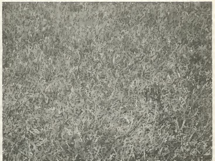
Figure 10. Close-up view of the treated area from the tests described in Figures 8 and 9 photographed in July 1973 approximately 3 years after spraying. The plots remained free of weeds for a minimum of 3 years following the single application of herbicide.