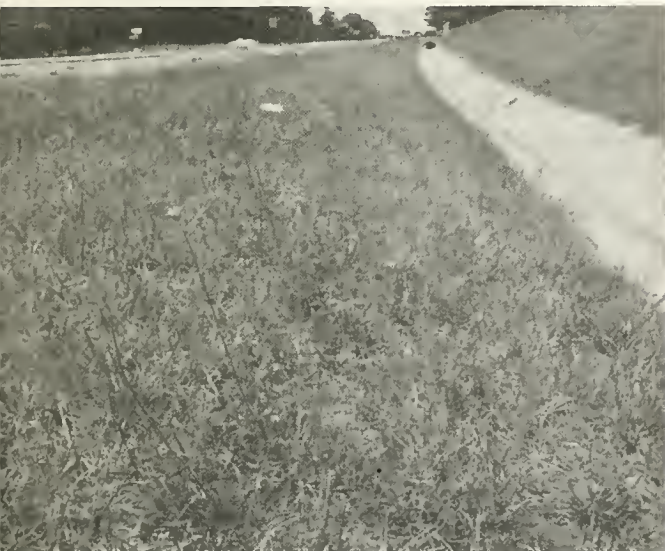
Figure 9. Same test area as shown in Figure 1 photographed in July 1972 approximately 2 years after spraying with varying rates of the picloram-2,4-D combination herbicide. Even though the area was recently mowed, growth of wild carrot, buckhorn plantain, and other weeds was evident in the check plot in the foreground. The treated plots remained free of weeds.