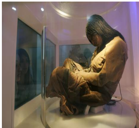
Figure 2: Lullailloco Maiden from Reinhard 2005.

Located on the summit of Mt. Lullailloco, researchers uncovered three tombs of child sacrifices nearly perfectly preserved (Ceruti 2003). Tomb One interred the remains of a young boy (commonly referred to as Lullailloco Boy), age seven, accompanied with "...two miniature figurines, spondylus shell, one pottery vessel (an aríbola), slings, extra sandals, and several small woven bags (chuspas)" (Bray et al 2004:88). He was also recovered with small bags containing coca leaves and traces of human hair (Ceruti 2004).