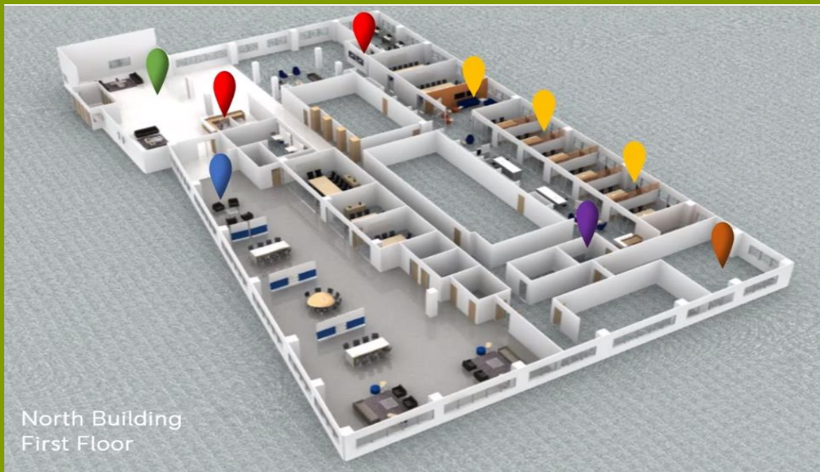
North Building First Floor