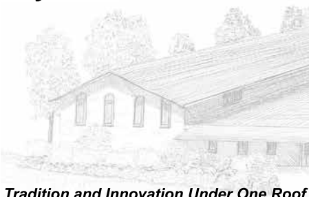
Tradition and Innovation Under One Roof