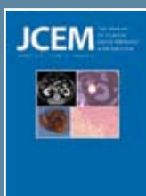
The Journal of Clinical Endocrinology & Metabolism

The Most Cited, Must-Read Clinical Journal in the Field