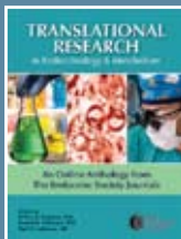
Translational Research in Endocrinology & Metabolism