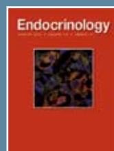
Endocrinology & Molecular Endocrinology

An In-depth, Enduring Resource With the Highest Impact Factor in Endocrinology and Metabolism