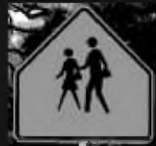
Fluorescent Yellow-Green School Signs