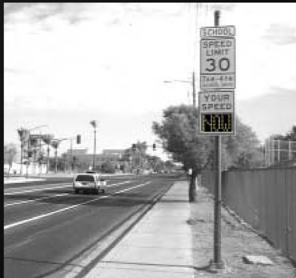
Active Speed Monitor