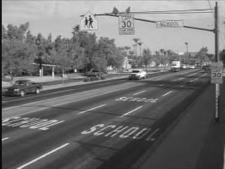
Overhead School Sign