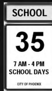
Reduce Speed Limit Signs