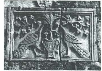
Byzantine carved panel on the treasury wall of St. Marks, Venice