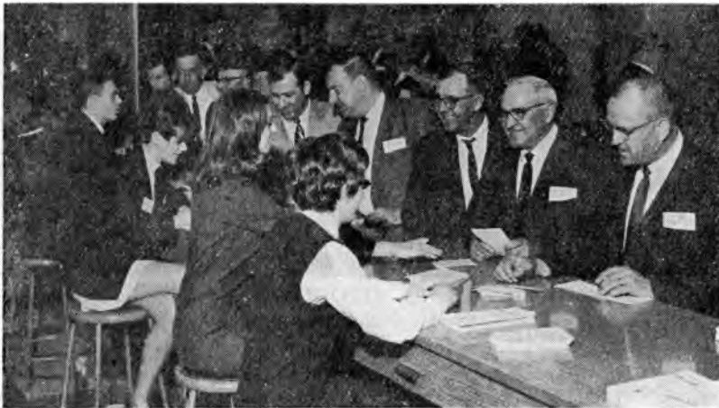
Fig. 1. ROAD MEN GATHER—Long lines gathered at the registration desk for the 55th annual Purdue Road School. Registration reached a total of 1,076 by Wednesday afternoon. Attending were large groups from the State Highway Commission, as well as county commissioners, traffic engineers, county auditors, and representatives from contractors and equipment suppliers.