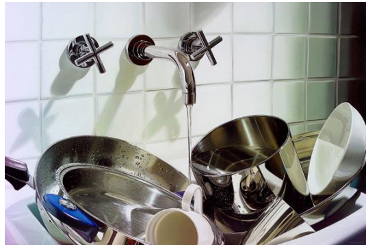
Figure 1. A natural and an artificial image used as stimuli

Subjects rated 47 real photographs and 47 contrived scenes for their subjectively perceived degrees of artificiality on a range from one to nine. Note that the pictures were purposely selected to be of a wide range of artificiality and to some extent even of doubtful natural character to induce individual assessments. As a consequence, the given artificiality rating showed a significant difference in the given ratings for stimuli of real (mean = 3.06) and contrived (mean = 5.85, p < 0.001 ) origin as well as a high inter-individual range (mean range = 6.05). This indicates that while in general real pictures can reliably be dissociated in natural and artificial representations, the inter-individual assessment of artificiality is strongly driven by subjectivity. In extreme cases, one and the same picture could be rated as being "clearly natural / 1" by a subset of participants while others judged the same scenery as "clearly artificial / 9". Therefore, the analyses of brain responses to the exposure to real or contrived pictures have to be grounded in a subjective classification rather than in averaged group responses.