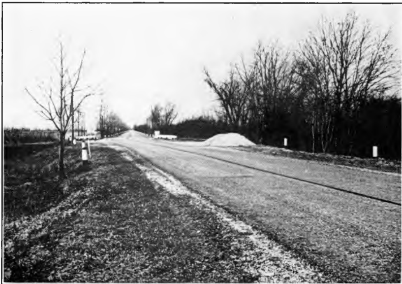
Fig. 2. A general view of a portion of J.H.R.P. Test Road No. 3.

some of these variables could be evaluated. Consequently, during the summer of 1939, in co-operation with the Highway Commission, 51 test sections, each approximating 1000 feet in length, were constructed by the maintenance forces of the LaPorte District on State Road 8 in northern Indiana. This particular road was chosen because of its uniform base and subgrade conditions, the underlying soil being quite sandy. The amount of traffic throughout the length of this test road is also fairly constant. Three types of bituminous materials, namely, rapid curing asphalt cut-back RC-3, asphalt emulsion AES-3, and tar TH were combined with crushed stone from two sources and of four gradings. The amounts of these bituminous materials were varied for the different aggregate gradations. Samples of the covering aggregate were taken from the road immediately before the application of bituminous material for moisture-content determination. Complete records were kept during construction on each of the sections as to the quantity of materials, construction procedures, etc. Photographs were taken of the various construction operations and of the surface textures of typical sections after construction. Measurements of surface textures by means of the profilometer were made immediately after construction and also after seven and twelve months' service. Periodic inspections and ratings have been made of these sections since construction.