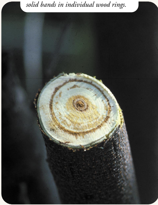
Fig. 2 - Cross-sections of Redbud stems infected with verticillium show brown solid bands in individual wood rings.