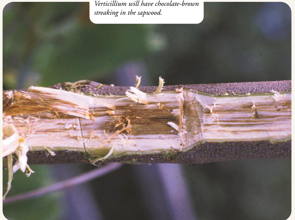
Fig. 3 - Redbud trees infected with Verticillium will have chocolate-brown streaking in the sapwood.