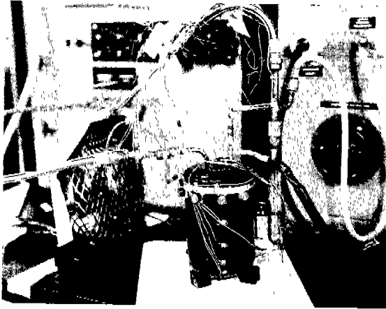
[Figure 3. Experimental setup with airflow over compressor using a fan]

To verify the theoretical prediction a compressor is modified to attach 24 thermocouples at various locations. The experiment was carried out on a calorimeter and various temperatures are measured [Figure 3]. The experimental data is compared against theoretical predictions and a good agreement is found. Table 1 describes the theoretical as well as experimental temperatures (in degree Fahrenheit) at various locations.