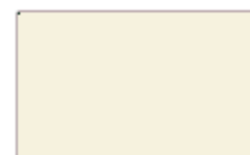
Figure 3: Coordinated Study [27]

The third type, “Coordinated Study,” is the most fully integrated and “may involve coursework that faculty members team teach. The course work is embedded in an integrated program of study” [27].