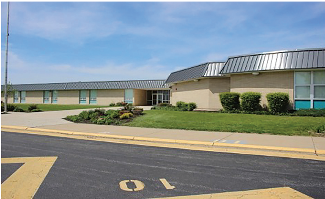
Figures 1 and 2. Burnett Creek Elementary (above) and Mintoine Elementary (below), two local elementary schools that the author worked with during her semesters in Ayuda y Aprende .

program. The Purdue student volunteers and the Spanish-speaking students worked together to enhance their understanding of each other's languages, as well as learning more about each other, their respective backgrounds and languages. Each semester was also different in the interactions I had with the students and the teachers, some more involved than others, proving there to be both positive and negative experiences during community involvements such as this. However, service-learning is an experience that cannot be repeated through a typical classroom setting, and Ayuda y Aprende has allowed