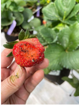
Fig. 6. Fungus gnats caused damage on ripening strawberry fruit when the fruits directly contacted the growing medium