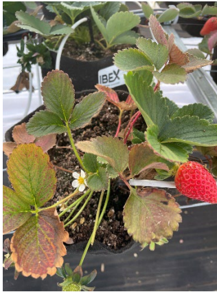
Fig. 5. A declined plant of cultivar Florida Brilliance. The photo was taken on 6 Dec. 2021.

mold ( Botrytis cinerea ) affected a few fruits lying on the growing medium. Gray mold pressure in general, was low in the trial.