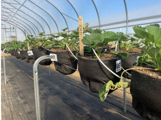
Fig.1. Strawberries were grown in 1-gallon black fabric bags. Each bag has an irrigation stake.

Eight strawberry cultivars (McNitt Growers, Carbondale, IL) were evaluated in this study, including three day-neutral cultivars ‘Albion’, ‘San Andreas’ and ‘Monterey’, three short-day cultivars recently released from the University of Florida ‘Florida Radiance’, ‘Florida Sensation’, ‘Florida Brilliance’ and two relatively older short-day cultivars widely grown on plasticulture in North Carolina ‘Chandler’ and ‘Sweet Charlie’.