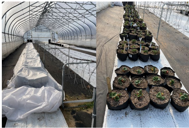
Fig.2. The growing bags were placed on the ground inside the high tunnel and covered with a floating row cover in the winter (left). Plants were pruned close to the crown before bags were moved back onto the bench system (right)

Bags were placed on the ground inside of the high tunnel and covered with a 1.5-oz thickness floating row cover in the winter (5 Jan. to 22 Feb.2022) (Fig. 2). The bags were overhead irrigated once in the winter. Dead leaves and flowers were pruned down to the crown before bags were moved back onto the bench system in the spring.