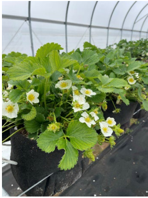
Fig. 4. A ‘Chandler’ leaves showed interveinal chlorosis symptoms as growing medium pH increased in the season.

7.8 by the end of Mar (data not shown). The interveinal chlorosis symptom gradually recovered in Apr. after adjusting the irrigation water pH to 5.5. The nutrient disorder may have negatively affected strawberry yield, particularly for ‘Chandler’.