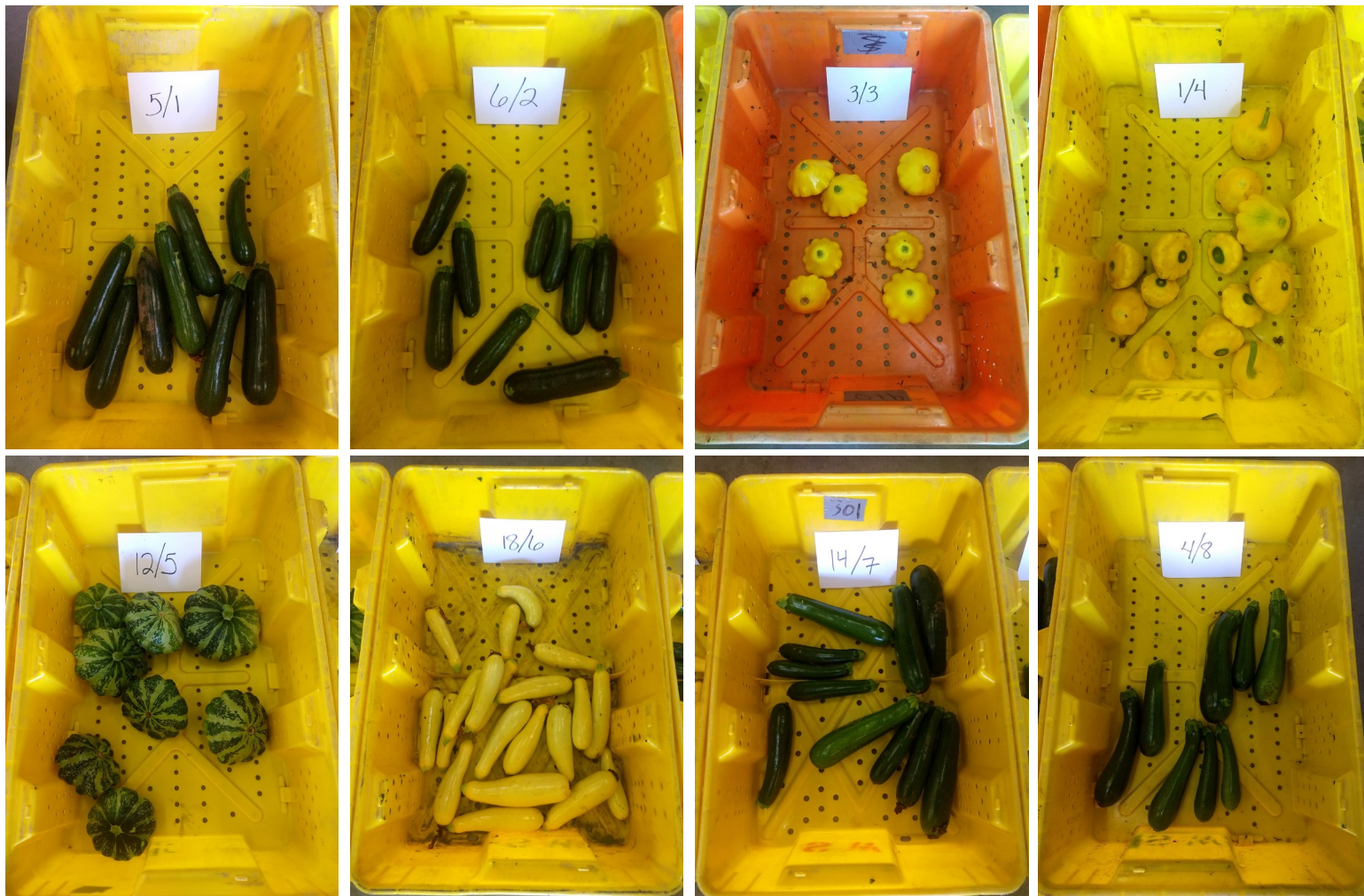
Figure 2. Pictures were taken after the twelfth harvest on 29 Jul. Each box represents the harvest from 8 plants in one replication. First row left to right: (5/1) HM Tribute, (6/2) SK Triumph, (3/3) PA Lemon Sun, (1/4) Sunburst. Second row left to right: (12/5) PA 21EDI06, (18/6) RP Blonde Beauty, (14/7) UA VS18014122 (4/8) UA VS18014112.