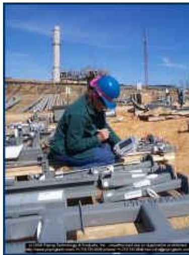
FIGURE 2 PIPING TECHNOLOGY & PRODUCTS, INC.

the reader to the passive (no battery required) RFID tag. When a tag is brought into the magnetic field produced by the reader, the recovered energy powers the integrated circuit in the tag, and the memory contents are transmitted back to the reader. Once the reader has checked for errors and validated the received data, the data is decoded and restructured for transmission to a user in the format required by the host computer system. The RFID tags used were both readable and writable. This capability enables information to be written back to the tag for enhanced asset management. RFID tags do not require a line of sight for identification and readability is not affected by bright lighting situations.