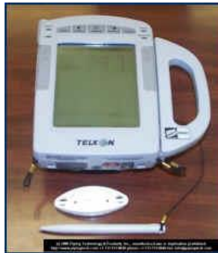
FIGURE 1 THE RFID TAGS AND RFID HANDHELD READER USED BY PIPING TECHNOLOGY & PRODUCTS, INC. (AT THE BECHTEL RED HILLS POWER PLANT)

A RFID system consist of two major components (reader and the tag) which work together to provide the user with a non-contact solution to uniquely identify people, assets, and locations.