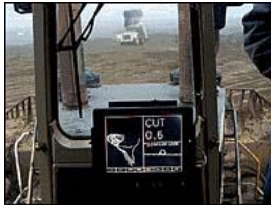
FIGURE 3 DISPLAY MOUNTED WITHIN THE CABIN