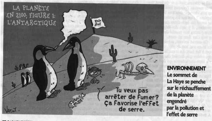
Fig. 3. La Planète en 2100. Vadot ( Le Vif/L'Express Nov.17, 2000; www.nicolasvadot.com, Vadot © all rights reserved). Rpt. with permission.