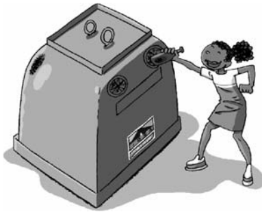
Fig. 9. Le recyclage (Courtesy of IDEA, Dossier Pédagogique). Rpt. with permission.