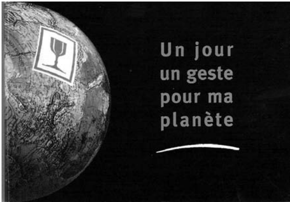
Fig. 2. Cover of Un Jour; un geste pour ma planète . Ministère Wallon de l'Aménagement du Territoire, de l'Urbanisme et de l'Environnement de la Communauté Française de Belgique. (Bruxelles: Luc Pire, 2004). Rpt. with permission.

5. Selon vous, quelles actions ou initiatives, quels gestes peut-on faire tous les jours pour la planète? (fig. 2).