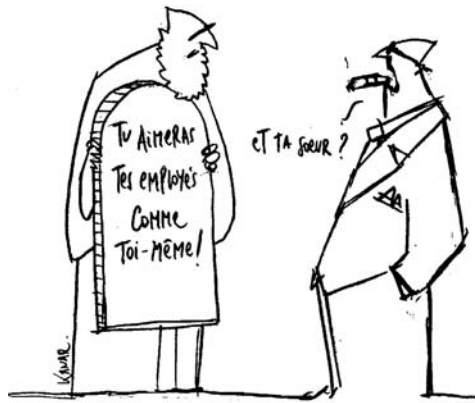
Fig. 1. Et ta soeur? Kanar ( Le Soir July 6 and 7, 2002. Kanar ©, all rights reserved). Rpt. with permission.

In the European Union, decisions made at the Council level (in Brussels) are to be implemented in the member states via the local communities (Lefevre; Favarel-Delpas). The EU aspires to uphold its responsibility as social model 15 and has adopted sustainable development as a way forward. Thus, it is important for American students to be aware of the cultural trends that are developing under this rubric. The French and European media are exploding with discussions on cultural and bio-diversity issues, for example. 16 Globalization, alter-mondialisme , ecology, organic vs. genetically modified foods, global warming, corporate and social responsibility, ethical investments, and fair trade are some of the sustainability topics in the headlines with the potential to engage, motivate, and promote creative speech in language classes (note, for example, fig. 1).