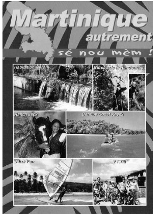
Fig. 12. L'Ecotourisme (Source: < http://martiniqueautrement.com >). Rpt. with permission.