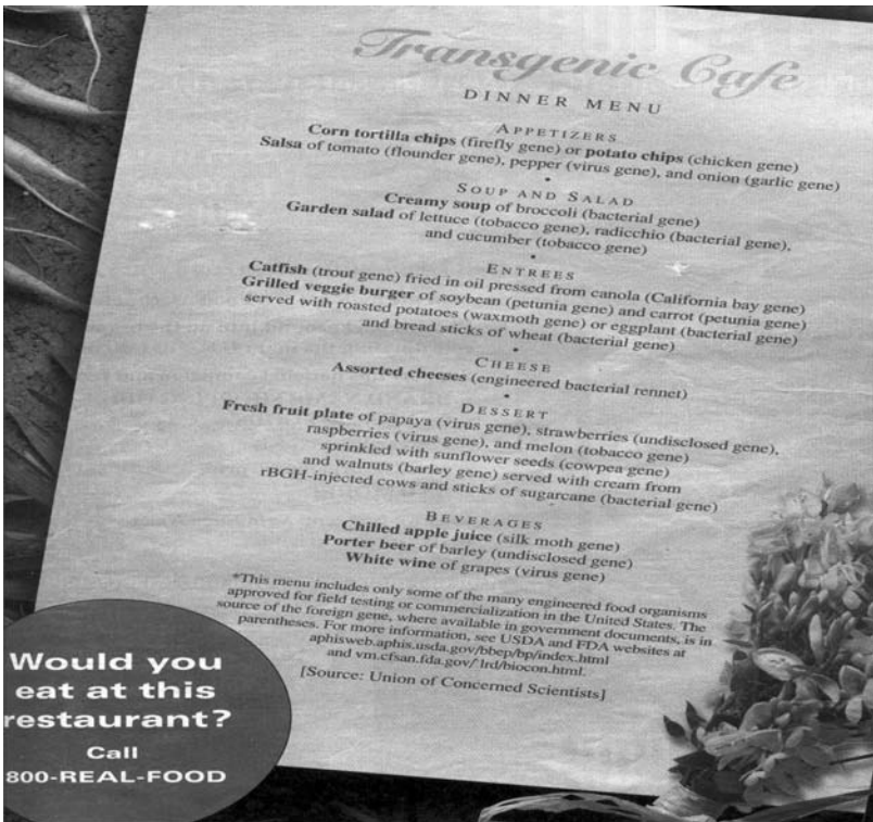
Fig. 7. Transgenic Café < www.safe-food.org > (Courtesy of Union of Concerned Scientists < www.ucsusa.org >). Rpt. with permission.

4. Comparez les sites US and français de Monsanto et Novartis. Du point de vue marketing: quelles différences remarquez-vous?