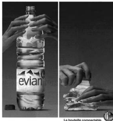
Fig. 10.

3. Que fabrique-t-on avec des bouteilles en plastique recyclées? (fig. 11). Voir < www.bluelotusblankets.com >; < www.fostplus.com >; < www.fostplus.be >.