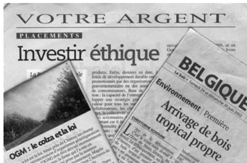
Fig. 6. Votre argent (Saint Paul © 2003).