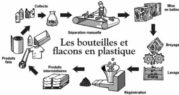
Fig. 11. Valorisation du plastique.