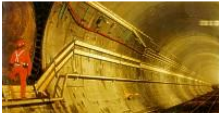
FIGURE 1 GRP CABLE TRAYS USED IN THE CHANNEL TUNNEL

Electrical cable trays need to meet strict requirements regarding structural and fire behavior. Cable trays made with a Glass-fibre Reinforced Plastic material provide these benefits.