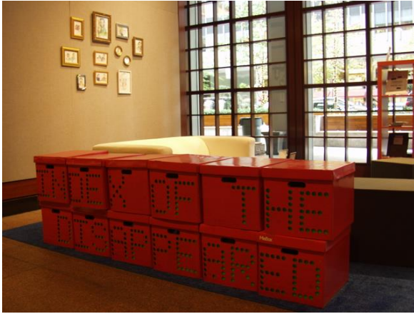
Figure 4. Installation view, Index of the Disappeared at UBS Galleries, 2007. Images courtesy of the artists © Index of the disappeared (Chitra Ganesh & Mariam Ghani)

(Fig. 4) At New York's Art in General at the UBS art gallery in 2007, where the Index showed alongside other art activist groups such as Camp Campaign , 18 the artists asked audiences about their memory associations with terms such as detention and deportation. Responses ranged from personally knowing people who were deported while doing their paperwork, to the artists explaining terms like Extraordinary Rendition for the audience. 19 This kind of interactive dialogue gestures towards an active participatory role between the artist and the audience. And when the issues being discussed or debated are about a political reality that is itself focusing on exclusions and inclusions, then the intersection of aesthetics with politics can lead to a productive exchange. This is one of the strengths of the Index , in re-presenting absences, it materially re-arranges and makes visible what was hitherto invisible, whether through deliberate redactions or through highlighting those absences textually.