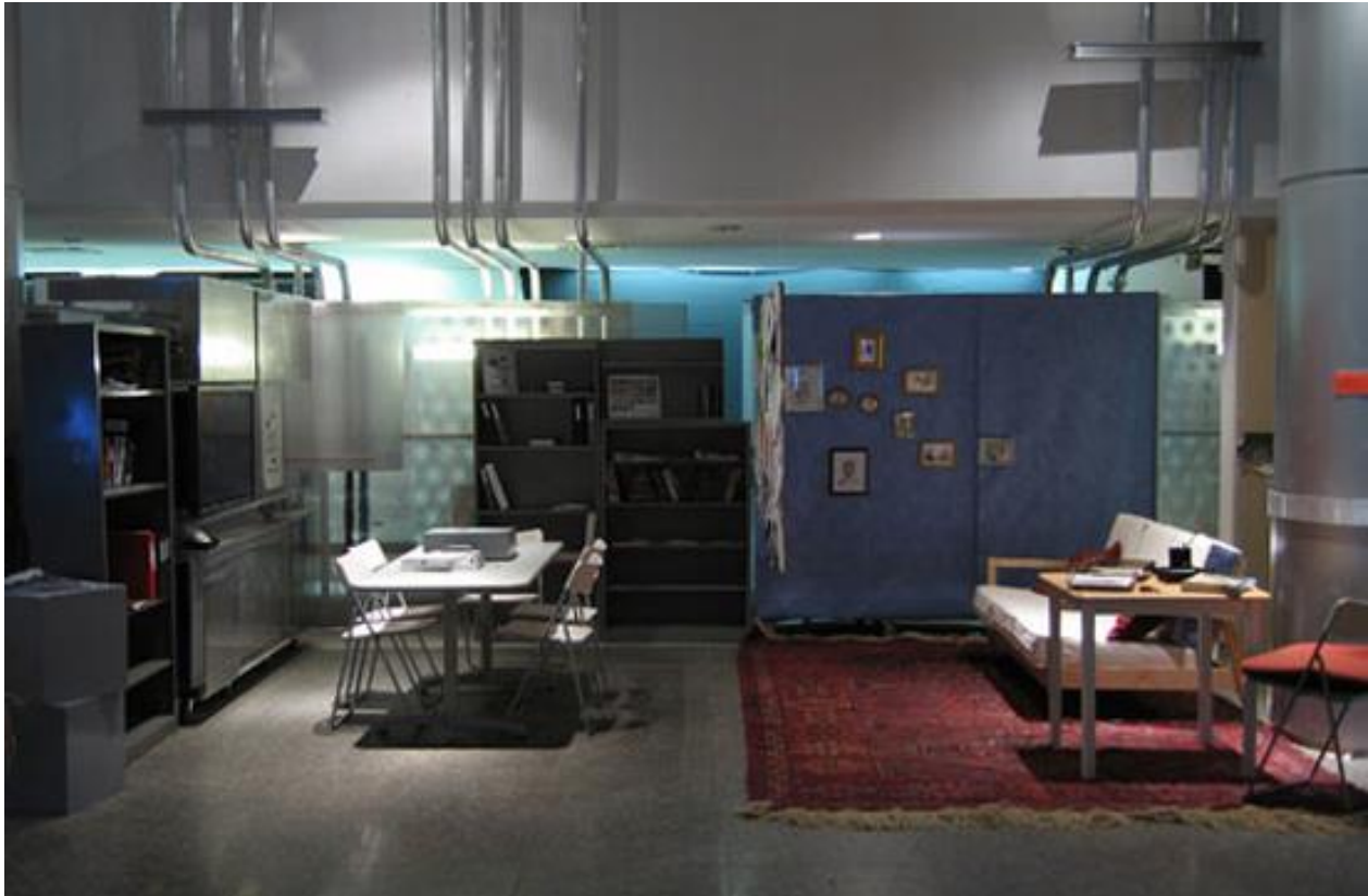
Figure 3. Installation view of Index Reading Room, LMCC 2005. Images courtesy of the artists ©Index of the disappeared (Chitra Ganesh & Mariam Ghani)

across different nationalities and in many tongues, activating spaces but without taking a confrontational political stance.