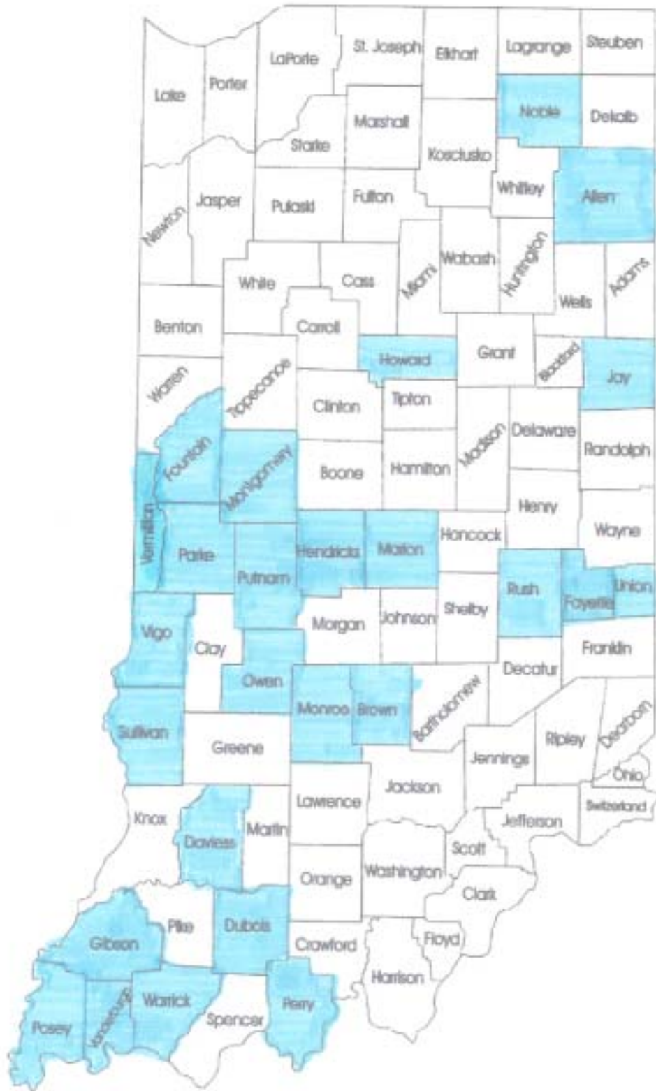
LOHUT County Map