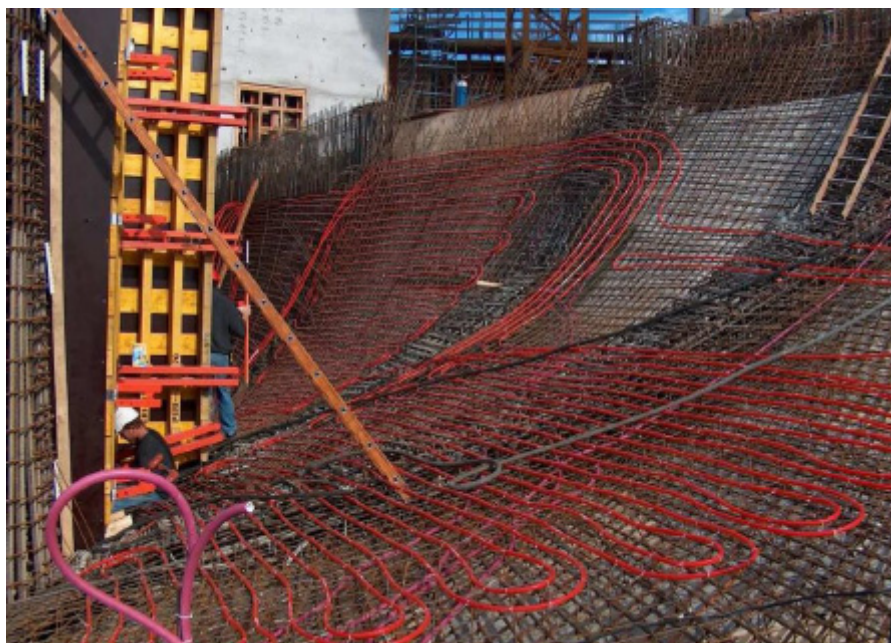
Figure 1: Flexible mounting of the pipe network at the Mercedes Benz Museum - Stuttgart/Germany

In the early 20th century the company Crittall already placed on the market a ceiling heating system in the form of concrete elements with steel pipe integrated registers. Known as the "Crittall-ceiling" this system was used in Europe in the 1920s and 1930s with great success. A serious drawback of the Crittall-ceiling were its huge 5/4 inch pipes, which were necessary due to insufficient thermal insulation of buildings. In these days the main problem with thermal activated building parts was the formation of condensation water due to insufficient control systems. The "Down Building" in Zurich (Switzerland, 1991, 7500 m) brought the concrete core activation for passive cooling back into focus. With precise temperature control and humidity control of indoor air condensation water formation could be excluded. It was followed just three years after the construction of the "Down Building" by the "Sarinaport Office Building" (Switzerland, 1994, 9500 m). This was one of the first buildings that used thermal concrete core activation for both heating and cooling. In the early 21st century concrete core activation enjoys more and more popularity. Already in 2003, approximately 30 % of all new commercial buildings were designed for concrete core activation and implemented with such systems.