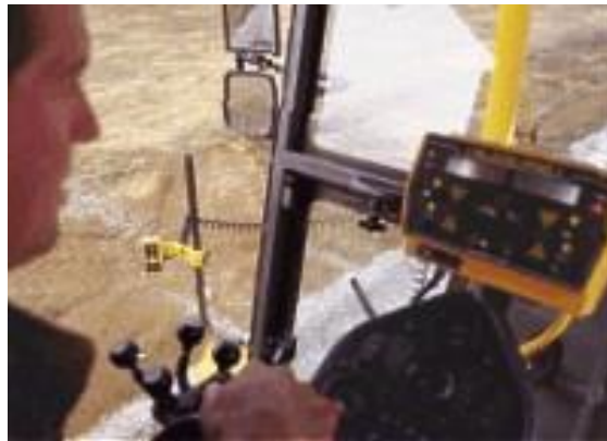
FIGURE 3 BLADE-PRO CONTROL SYSTEM

BladePro System combines a digital terrain model (DTM) design software, Geodimeter robotic total stations, and motorgrader control system to automatically control elevation and cross slope of the motorgrader blade. This flexibility is built into the BladePro system by using the Tracer Ultra Sonic Grade Controller or the Laserplane Transmitter and Receiver with Electric Mast. A graphical operator interface accepts digital design using a data card. BladePro uses a robotic total station to track and communicate the motorgrader's position and blade elevation anywhere on the job site by transmitting the real-time positioning data and by comparing it to the design stored on the data card. When a correction is needed signals will be sent to the machines hydraulics to maintain the design elevation and cross slope.