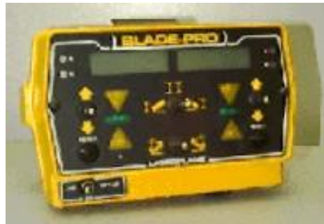
FIGURE 1 BLADEPRO: MOTORGRADER CONTROL SYSTEM

Currently most of the methods to control grading equipment to achieve the required production accuracy are based on conventional surveying, such as grade stakes and stringlines. Some methods using automatic measurement sensors were also developed to guide and/or control construction equipment efficiently. The use of laser transmitters and sonic tracers has greatly reduced the cost of construction projects. Yet, many existing systems do not work well with more complex grading applications such as vertical curves, transitions and super-elevated curves.