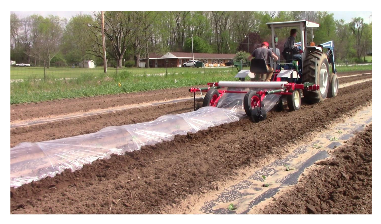
Figure 1. Low tunnel covered with 1 mil perforated row cover was installed using a mechanical transplanter low tunnel layer on 24 Apr. 2020.