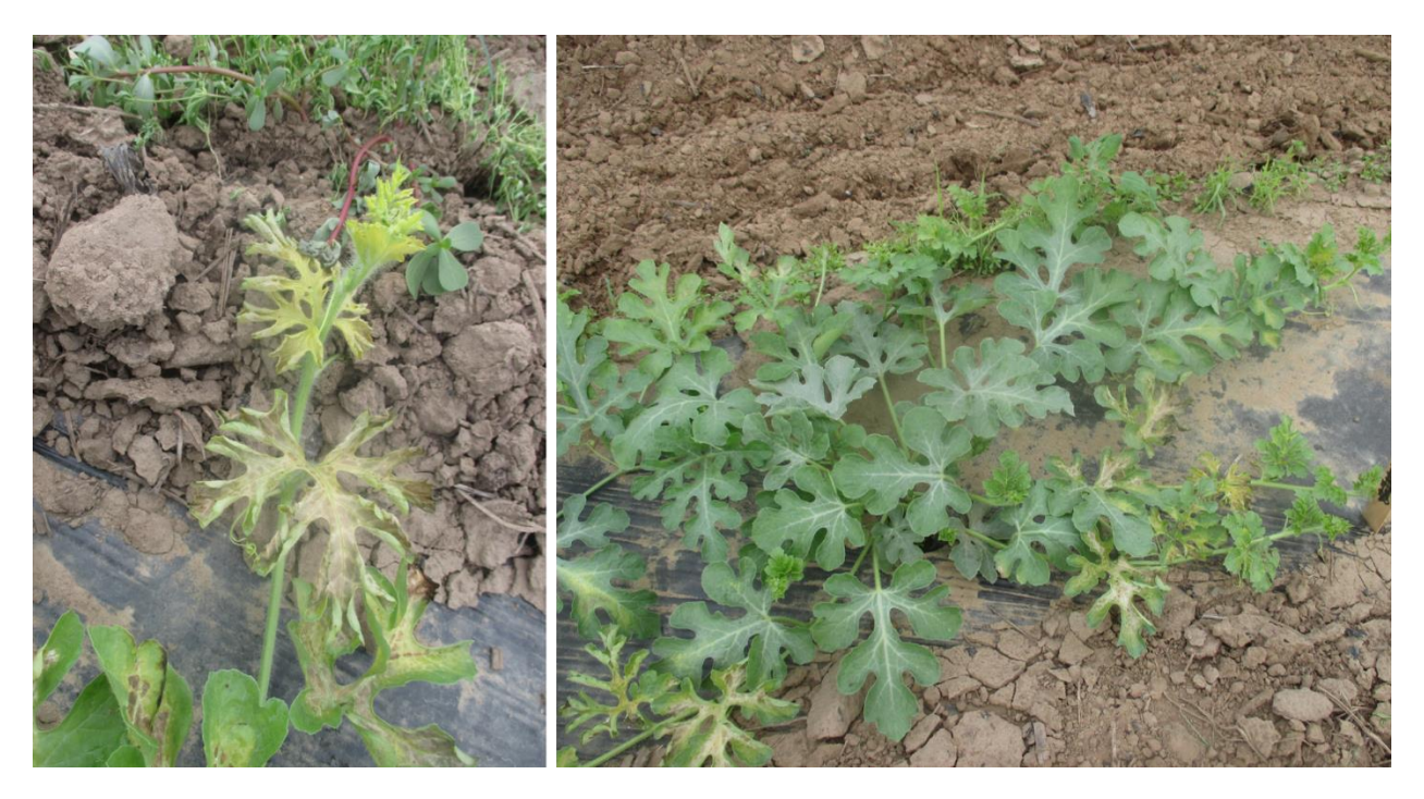
Figure 4. Heat injury on watermelon plants. Left: tips of the vines were yellowing right after low tunnels were removed. Right: plants recovered after a few days.