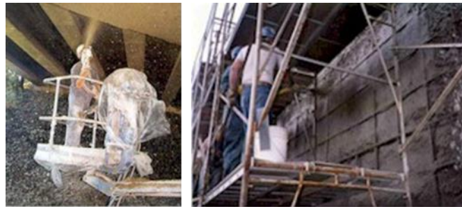
FIGURE 1 PREPACKED SHOTCRETE ADMIXTURE : SPRAY-CON WS

Over the past 10 years, the wet shotcrete method has become increasingly used in the repair of vertical and overhead concrete surfaces. This is due, in part, to advances in materials such as the introduction of silica fume (microsilica), fibers and superplasticizers, which not only make shotcrete easier to place, but also improve its durability. Batching all these materials in the right proportions with sand and cement can be difficult, so many manufacturers have developed pre-packed shotcrete repair mortars to which contractors add only water. The pre-packed materials simplify batching and provide more consistent quality. But packaging all the dry materials increases their cost. Gemite Products Inc. Amherst, NY developed pre-packed products (called "concentrates"), which include all the admixtures but require contractors to provide their own sand and cement. The material costs of concentrates mixed with sand and cement are considerably lower when compared with complete packaged systems, while maintaining the same quality.