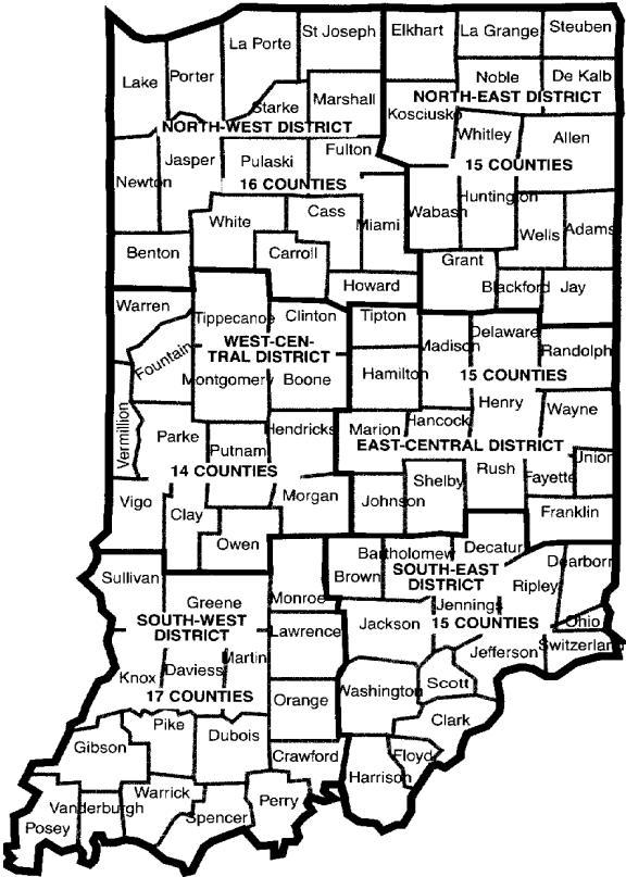
Indiana Association of County Commissioners District Map

ASSOCIATIONS - ASSOCIATIONS - ASSOCIATIONS