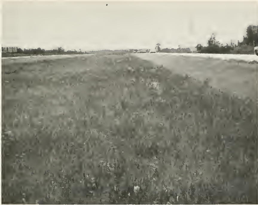
Figure 3. Unsprayed median of I-69 near the Indiana-Michigan border. Numerous weeds are seen in the foreground. Photographed June 2, 1973.